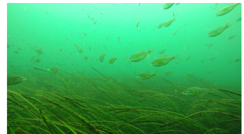
Eelgrass and shiner perch